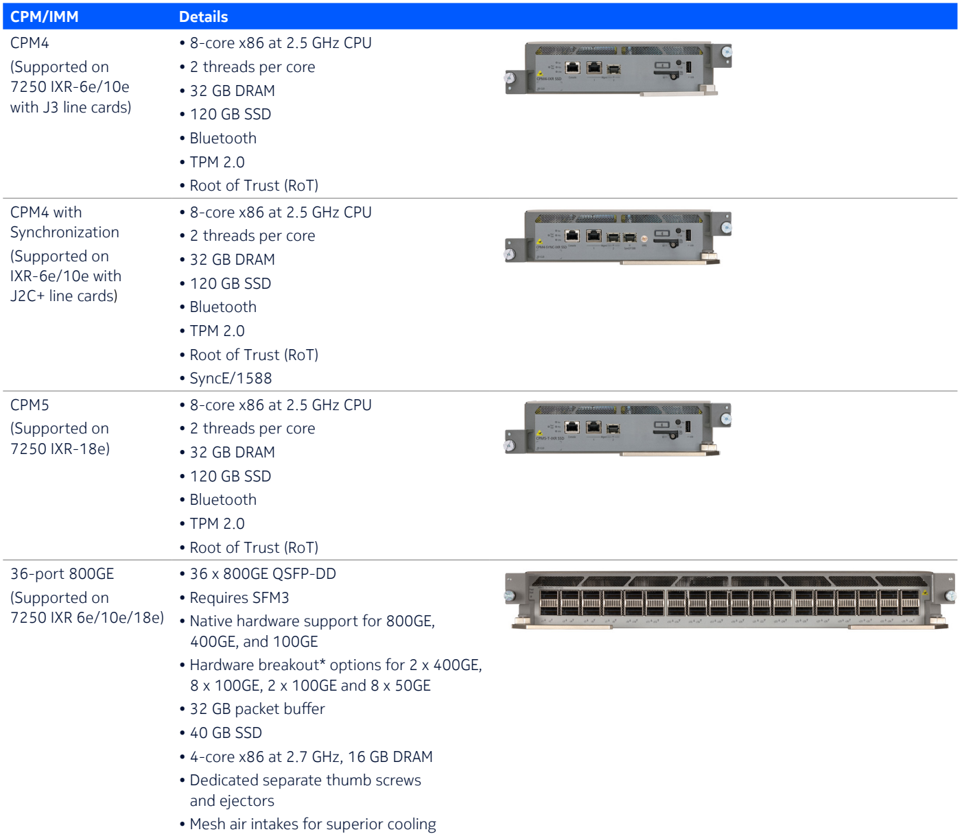
Table 2. 7250 IXR-6e/IXR-10e/IXR-18e IMM cards

* Some breakout options require future software support and specific DAC cables